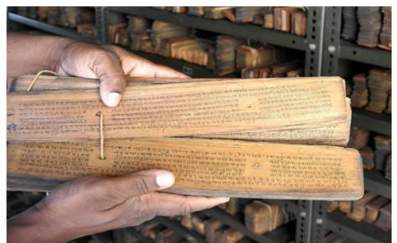
Preserving history: The mission is an initiative to identify, document and digitise India's vast manuscript heritage. FILE PHOTO