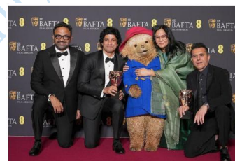
Sweet moment: Creators of Boong with their award at the 79th British Academy Film Awards in London on Sunday.

Manipuri film creates history; secures first BAFTA win for India