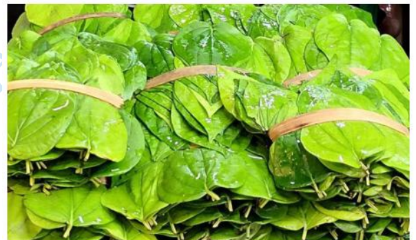
Mysuru betel leaves, characterised by their heart-shaped form and pungent flavour, are traditionally valued for their digestive and mouth-freshening properties. M. A. SRIRAM